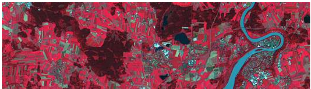
IRS-1D LISS-III, Wasserburg a. Inn, Bavaria, 11-Aug-1998

IRS LISS-III data are well suited for agricultural and forestry monitoring tasks. Because of their simultaneous acquisition with IRS PAN data and the availability of a synthetic blue band, LISS-III data are ideal for colouring IRS PAN products.