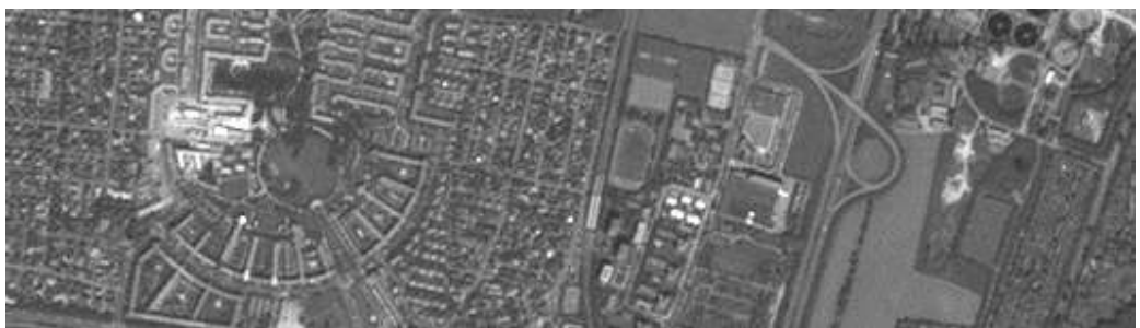
IRS-1D PAN, Munich suburbs, 11-Aug-1998

With 5 m resolution and products covering areas up to 70 km x 70 km IRS PAN data provide a cost effective solution for mapping tasks up to 1:25'000 scale.