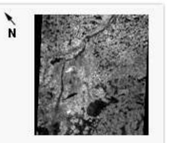
System corrected, path oriented